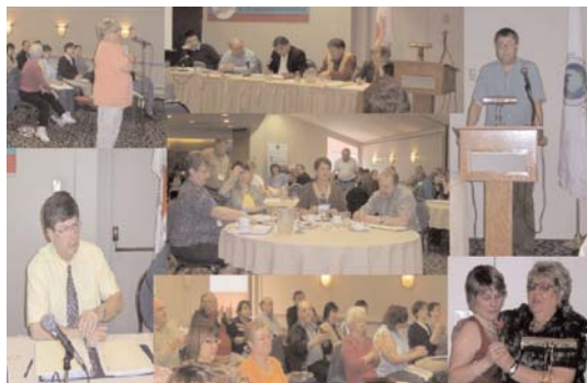
Pictured above is a collage of events from the FNI's 33rd AGA.

in Principle, presentation by RCMP for recruitment, presentation by the President of FNI which outlined the timeline of the organizations, address from Chief of Congress of Aboriginal Peoples, election of Central Vice President and Youth Director, program reports of the FNI, a presentation by Terra Nova National Park and resolutions to guide the executive and board of directors for the fiscal year of 2008-2009.