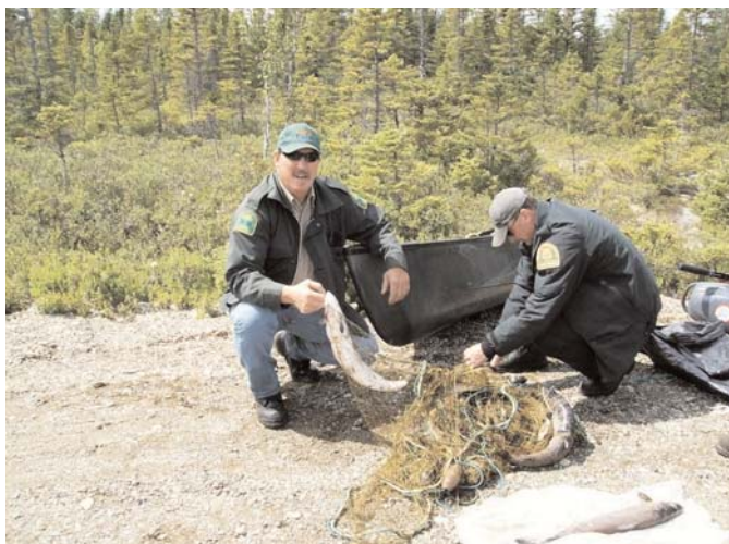
AFS Guardians removing salmon from a 75 foot net removed from Ragged Harbour)

In the 2010/2011 season twelve FNI River Guardians patrolled a number of water sheds in the Gander River and Bay St. George area. Thus far in the season the guardians have observed and confronted a number of infractions of the Fisheries Act ranging from illegal netting and retention of large salmon; to use of barbed hooks. The AFS Guardians concluded a successful season as of Friday, the 17th of September, and now are able to continue to patrol the rivers while conducting field work for several research projects acquired and facilitated by MAMKA.