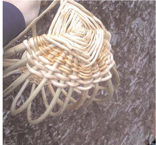
Pictured is a partially completed basket with the handle, ribs and the first sections of weaving started.