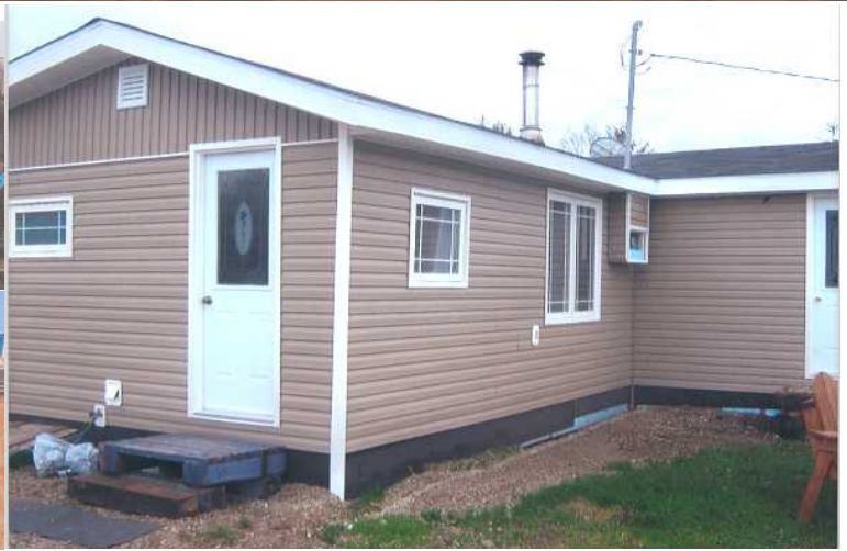
Pictured above is a collage of a home before and after home repairs were completed through the Home Repair Program.