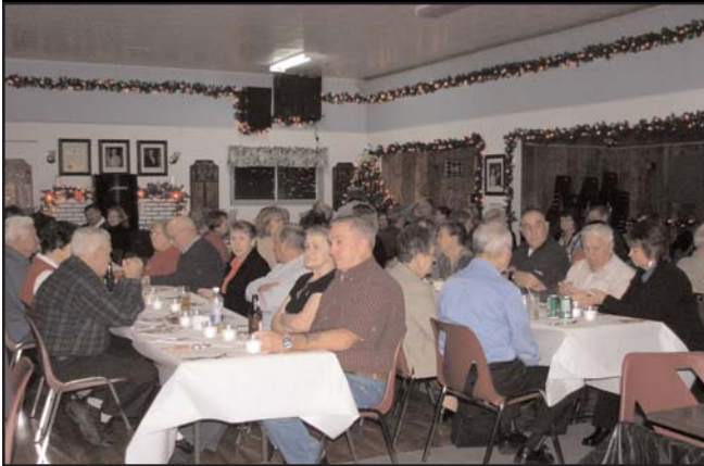
Elders who attended the the Feast came from as far as Corner Brook and Heatherton to attend our feast.