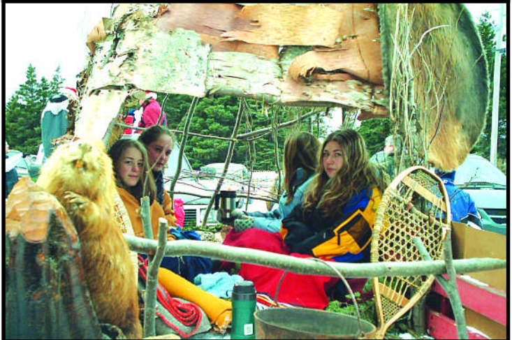
Several Indian Head First Nations youth huddle together in the wigwam on the Mi'kmaq float they entered in the local Santa Clause parade

The Indian Head First Nations Youth Group gave the surrounding communities a little taste of the Mi'kmaq culture during the Christmas season. The group entered a float in the local Santa Clause parade, complete with wigwam frame, animal props and Mi'kmaq youth singing and drumming. The group would like to thank all the people who assisted them in any way with the float.